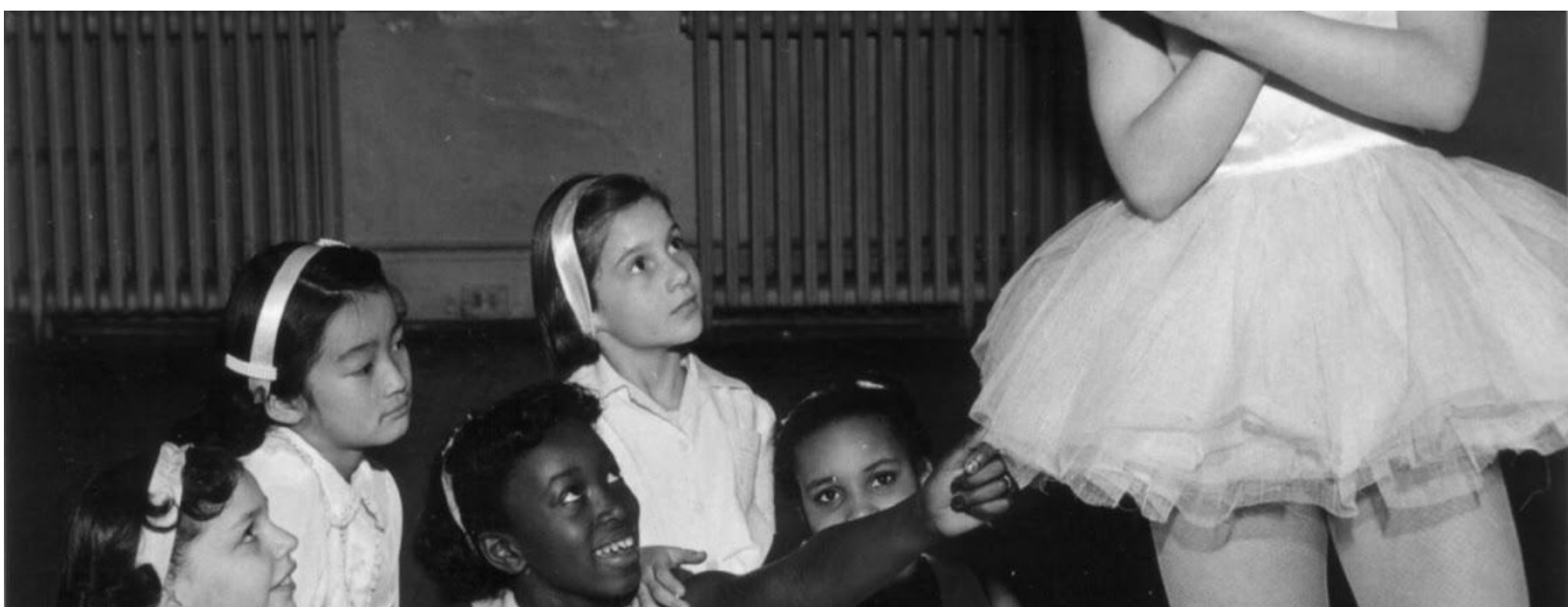
Visiting with the National Ballet